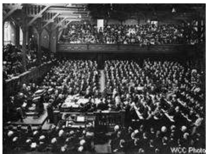
(Edinburgh 1910 Conference)

It is said that theology should start with questions, not with answers. So, I offer to you this question: "What is mission? What is power? How might our understanding of mission and power influence the healing of memories and ecumenical journeys and ecclesial vision? How do we participate in God's mission in an era of heightened globalization?" And I want to add there, "What does mission mean in a majority world context?"